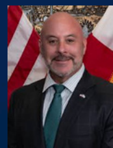
Blaise Ingoglia Florida Chief Financial Officer

TO SECURE YOUR SPONSORSHIP, EMAIL: EVENTS@LAKECOUNTYREPUBLICANS.ORG OR CALL 352-742-1972