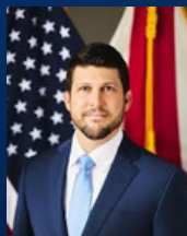
James Uthmeier Florida Attorney General